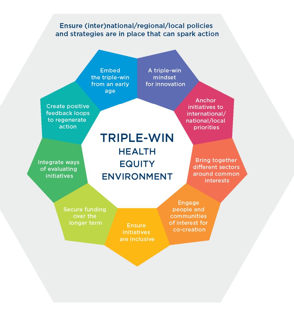
Figure 2. Overarching lessons for good practice for the INHERIT triple win.