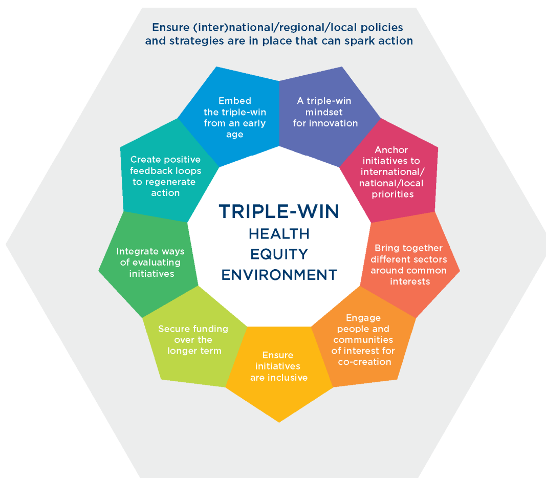
Figure 2. Overarching lessons for good practice for the INHERIT triple win.