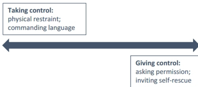
Figure 2 Control/agency spectrum.

Survivor (1.05): He came up behind and he said, Look, I don't want to stop you from doing anything but I'd like it if you could come over the barrier ... Just step on over, it's OK ... He said, I'm not going to take you away from here, you can stay here if you want ... It was like, he's not forcing me to do anything. I can still do it ... and that was important for me.