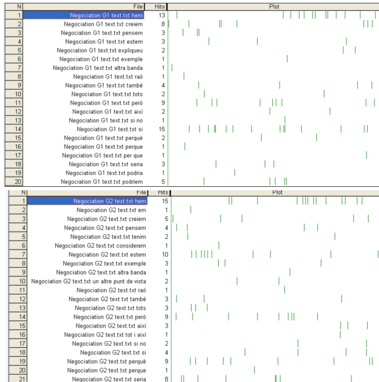
Figure 3: Number of times a word was mentioned (hits), the total of words in the text (words) and the dispersion plot in Group 1 (G1) and in Group 2 (G2).

Hem/em (we have); creiem (we think); pensem (we think); tenim (we have to); considerem (we consider); estem (we are); exemple (example), altra banda/un altre punt de vista (from other point of view); tots (all); si no/si (if); seria/hauria/podria (conditional); expliqueu (explain); perquè/ per què (why, because)