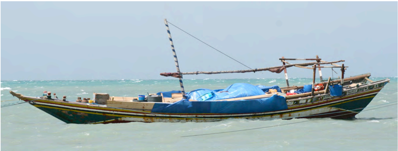
Figure 3. A large “winged” hūrī in the sea at al-Khawkha.