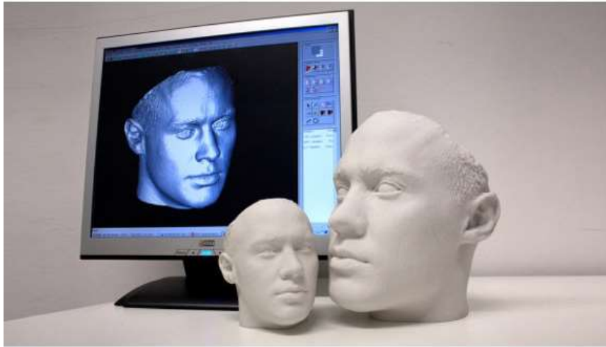
Figure 10: An Example of a 3D Printed Model

For large 1:1 scale models of "simple" geometry, such as the profile of the steps in this case study, models can be made from wood cut accurately to size and fixed together. An example of a constructed model for the above incident and its integration with the steps is shown in Figure 11. This constructed model was used in the courtroom in order to provide a visual reference to the jury on the dimensions of the steps. In addition, the physical model was of considerable use in assisting the explanation of the expert witness testimony, where the model was referenced multiple times demonstrating the methodology of measurements undertaken during the investigation.