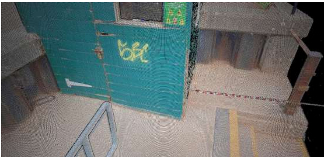
Figure 4: Photo-textured Point Cloud

Once a geometrically accurate model has been created, photographs can be applied to the point cloud providing a true visual representation of the scene. As the photographs were taken from the same location as the laser scan, the images can be converted first into a panoramic equirectangular image and then to a cube map. The cube map can be imported into point processing software such as Leica Cyclone and then projected outwards texturing the survey points, the result of which is shown in Figure 4.