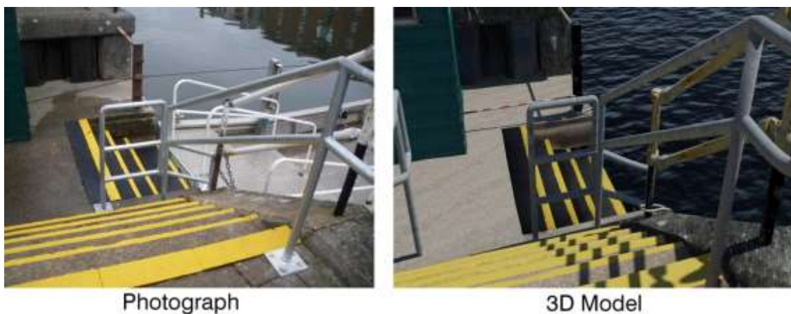
Figure 8: Comparison of Photograph to 3D Model

In order to produce a video animation of a scene, virtual cameras have to be located within the environment and paths created in which they are constrained to travel. A sequence of still images can be produced (or rendered) from the software, which can later be joined to create a video. In this particular case, the purpose of the 3D model was to demonstrate the changes in the steps and handrails. Animations were created from different camera locations that corresponded to photographs that were taken in the investigation process. An example of this is shown in Figure 8.