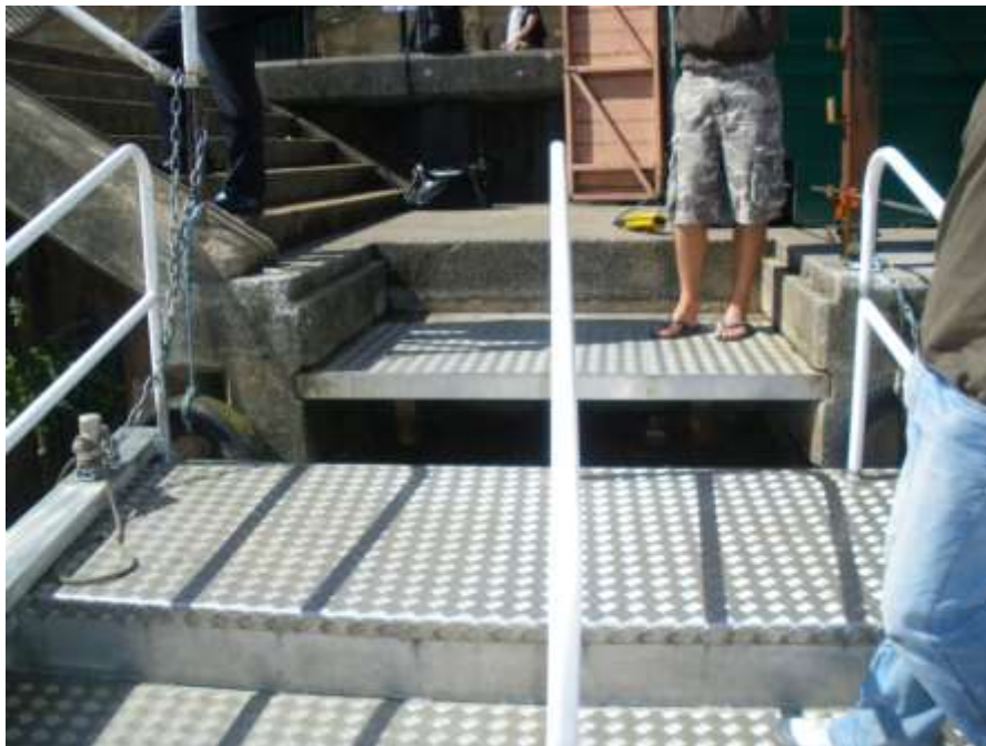
Figure 1: Step and Landing Platform

In 2010, an elderly lady died after disembarking a passenger ferry at a quay, when she fell from some quayside steps into a river below [21]. The steps and landing platform within the quay are shown in Figure 1.