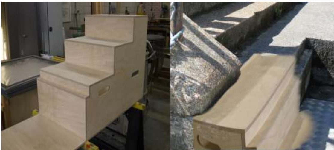
Figure 11: 3D wooden Model of the Steps

For large 1:1 scale models of "simple" geometry, such as the profile of the steps in this case study, models can be made from wood cut accurately to size and fixed together. An example of a constructed model for the above incident and its integration with the steps is shown in Figure 11. This constructed model was used in the courtroom in order to provide a visual reference to the jury on the dimensions of the steps. In addition, the physical model was of considerable use in assisting the explanation of the expert witness testimony, where the model was referenced multiple times demonstrating the methodology of measurements undertaken during the investigation.