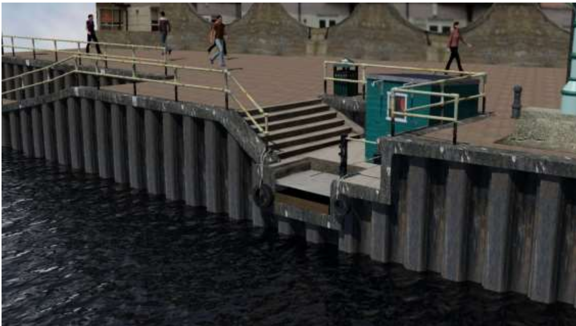
Figure 6: Screenshot of 3D Model

and date, can be applied to the model for more realistic lighting. A screenshot of the completed 3D model for the above case is shown in Figure 6.