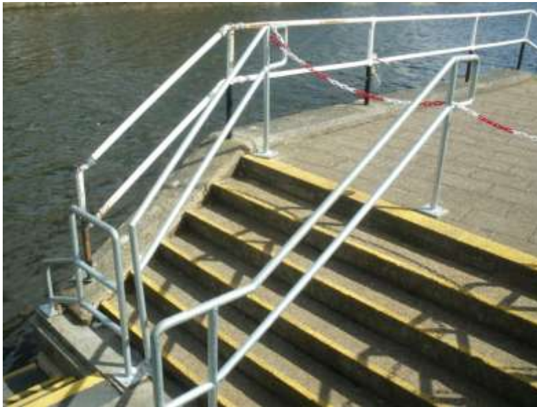
Figure 2: Changes to Steps Following Incident

Subsequent to the incident and upon recommendation of the Health and Safety Executive (HSE), a number of changes were made to provide a safer means of access and egress to the ferry. One of the changes to the steps is shown in Figure 2.