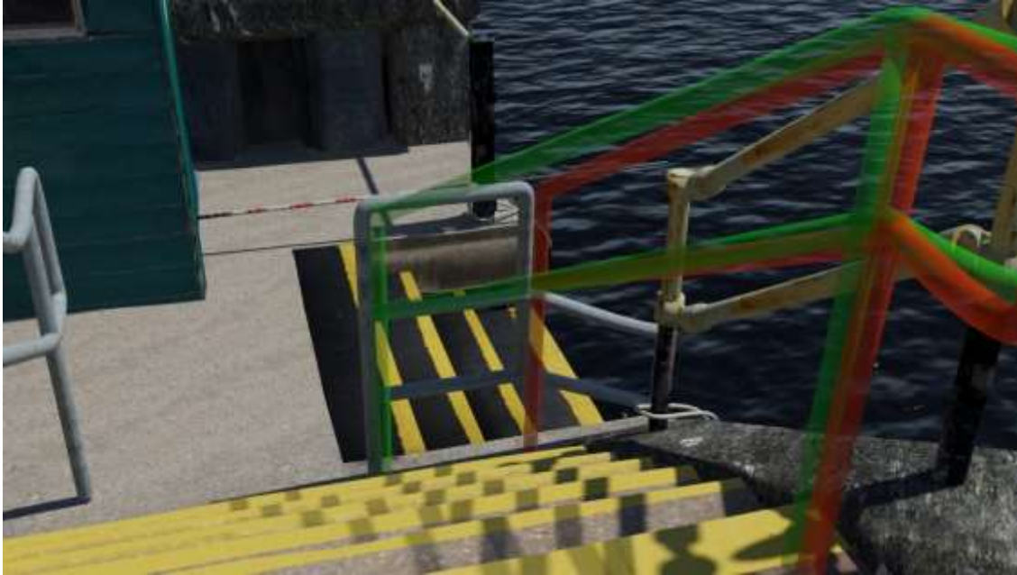
Figure 9: Illustration of Change to the Steps

changes made to the steps, animations were made to illustrate this, where additions were shown in green and removals were illustrated in red. An example of this is shown in Figure 9.