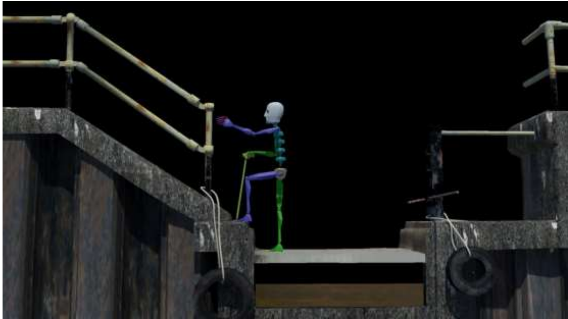
Figure 7: Scaled Person in the Scene