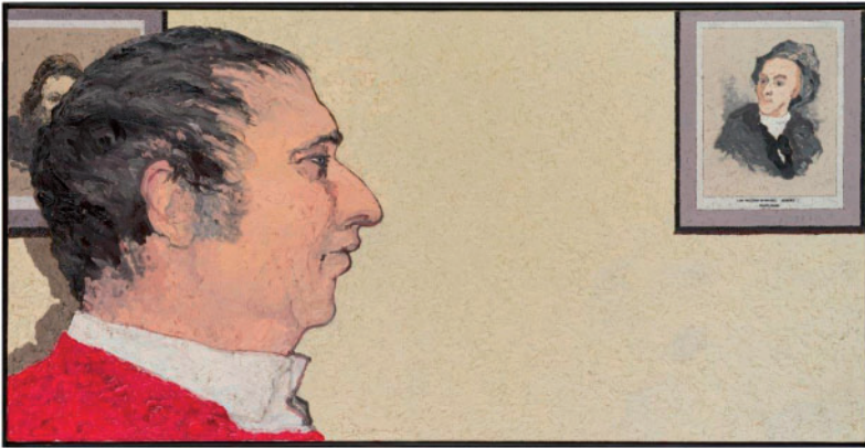
Fig. 3. Derek Boshier, 'Portrait of Christopher Logue' c. 1969. Muzeum Sztuki, Łódź.

There are many reasons why Logue might have felt a special affinity with the eccentric autodidact Pope. But the one that most readily suggests itself is their shared approach to the creative process of translation—the way both poets drew on all the resources of their language and culture in order to remake Homer.