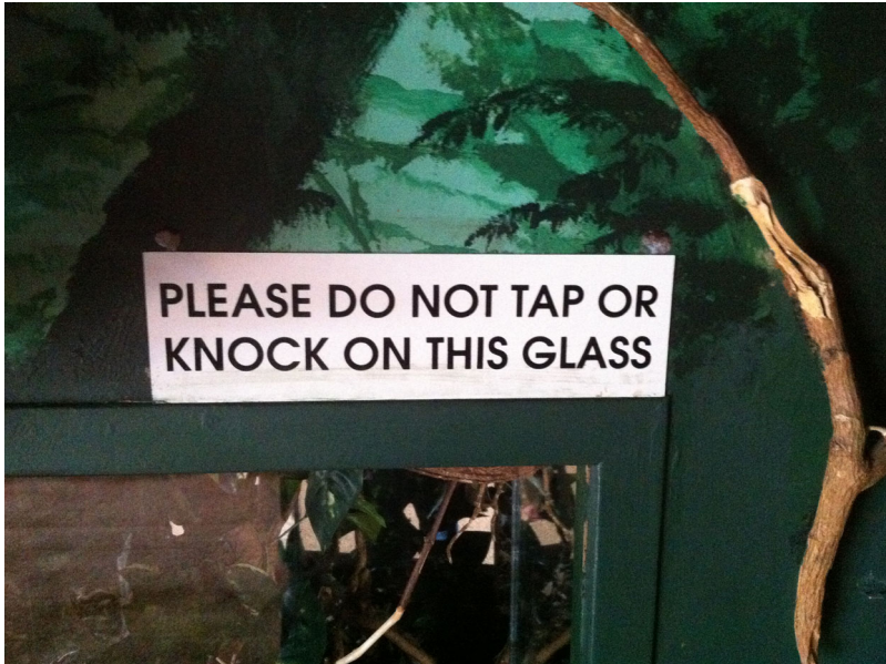
Figure 1. Sign on a vivarium at Bristol Zoo.

noise (indeed, news reports have quoted staff at various zoos claiming that some animals were unsettled by the quiet resulting from the Covid-19 lockdown closures). In a further expression of the complexities of sonic pastoral care, one zoo staff member we spoke to suggested that loud expressions of excitement on the part of children might be welcome as an indication that the zoo was succeeding in getting them interested in and engaged with the animals. It was well recognized by keepers we interviewed, however, that some species were very sound-sensitive and that sudden, loud, and unfamiliar sounds could affect them. Animals on display in zoos can often hide from the visual gaze of visitors. The nature of captivity and of sound, however, makes it difficult for them to escape from sonic disturbances altogether.