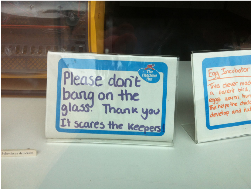
Figure 2. Sign from the Hatching Hut, Bristol Zoo.

(see Fig. 3). Inside, another sign stuck to the glass of the gorilla enclosure underlined the importance of sonic care (see Fig. 4). We noticed the following sign on one of Bristol Zoo's aviaries: 'Sssshhhh, please. It is the breeding season for our Sumatran laughing thrushes and they are sensitive to disturbance. Enjoy watching them quietly'. Zoo staff, then, seem to be trying to instil in visitors an appropriate sonic 'interspecies etiquette', and to make them more responsible and considerate 'sonic citizens' in the multispecies community that the zoo represents (Kim 2016; Warkentin 2010).