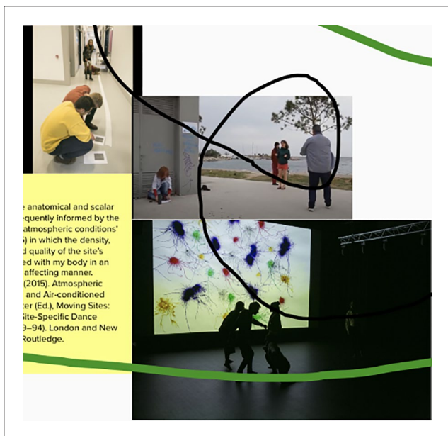
Figure 3. Images spatially glowing.

SciCulture occurs within and that practice can be disrupted by actively engaging with this . . .