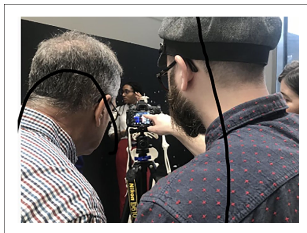
Figure 5. Cameras watching cameras glowing

SciCulture course considering how devices as co-participants and co-researchers, could be more pro-actively planned into pedagogy and research.