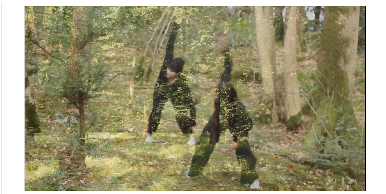
Figure 1. Dancers meshed with trees.

education by demonstrating how a posthumanizing approach to creativity makes us explore ethics in a less rights-based way to take a more obligations-based approach. This then leads to seeing and attending differently and beyond the word. It raises our awareness of a different kind of involvement which is tapped into through touch, presence, and attendance to light and temperature, and through stepping back. This in turn cyclically changes the way creativity is thought about, researched, and taught: It promotes consideration of the shape of the creative process and questions the separability of the arboreal and rhizomatic, moving to a more entangled understanding of their relationship as a metaphor for future explorations; it stretches pedagogy to include materiality; and it encourages a side-stepping of static education systems and energizes the alternatives.